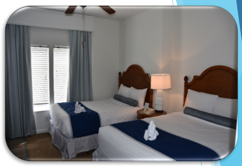
(1.253 Sq.- 116.4 m<sup>2</sup>)