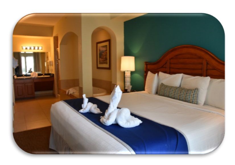
(1.080 Sq -100.3 m<sup>2</sup>)