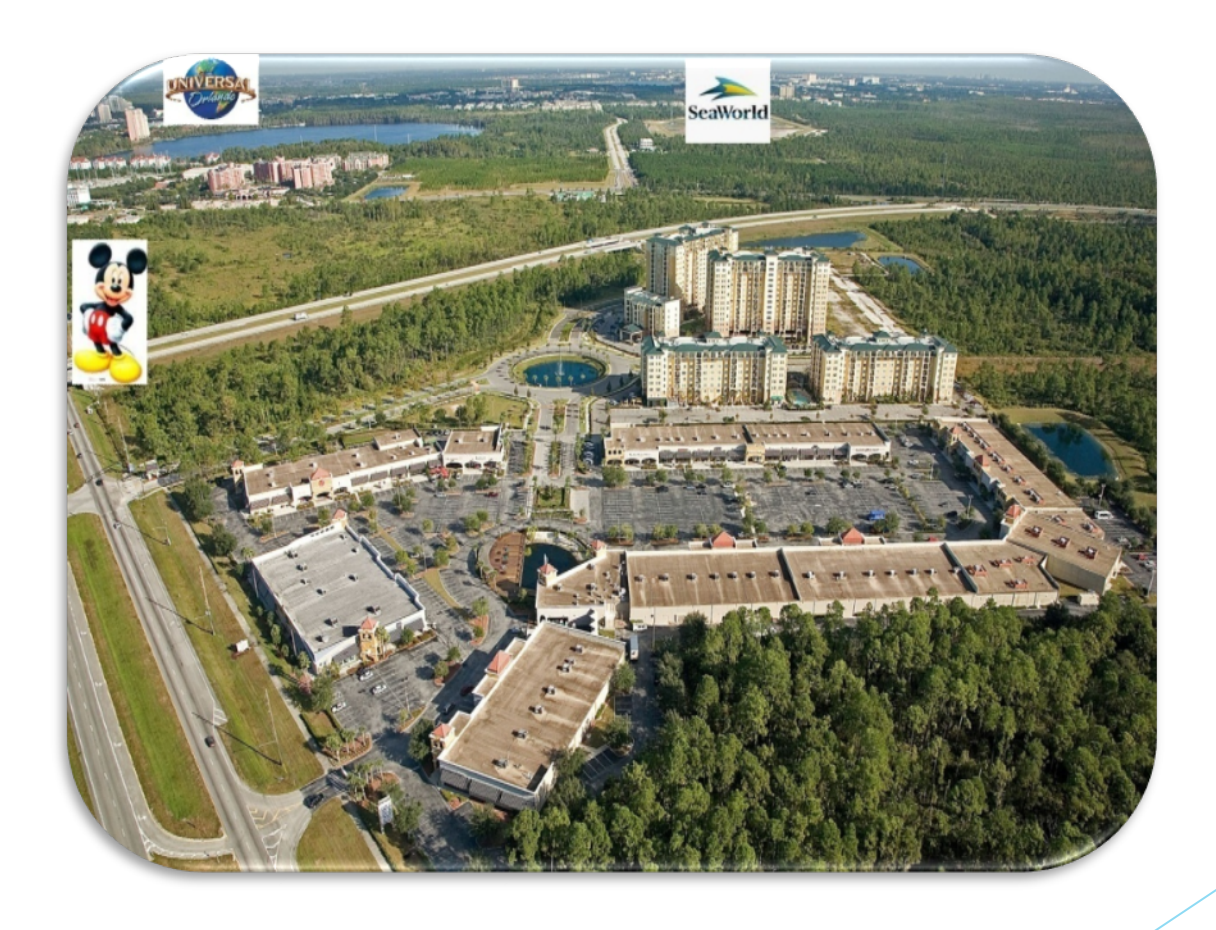
Superbly Located at the Doorstep of Walt Disney World